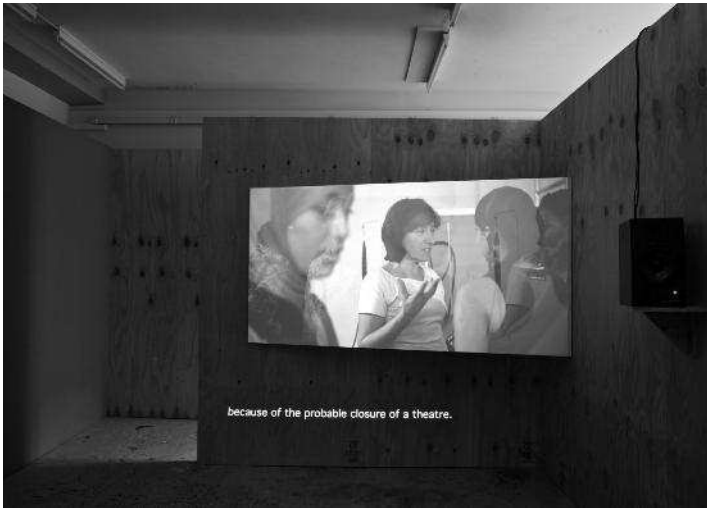
Opposite, top: Harun Farocki. Workers Leaving the Factory in Eleven Decades , 2006. Installation view. Raven Row, London.