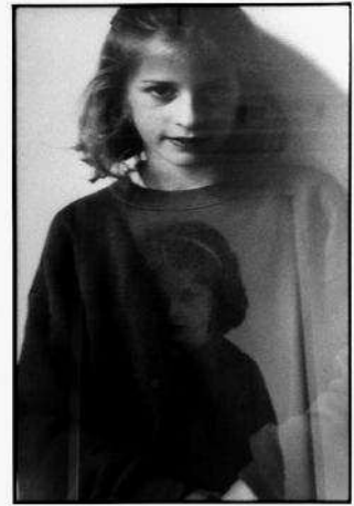
Above: Günther Förg. Zwillinge (Twins), 1986. Installation view of two black-and-white photographs. Stedelijk Museum voor Actuele Kunst (SMAK), Ghent.