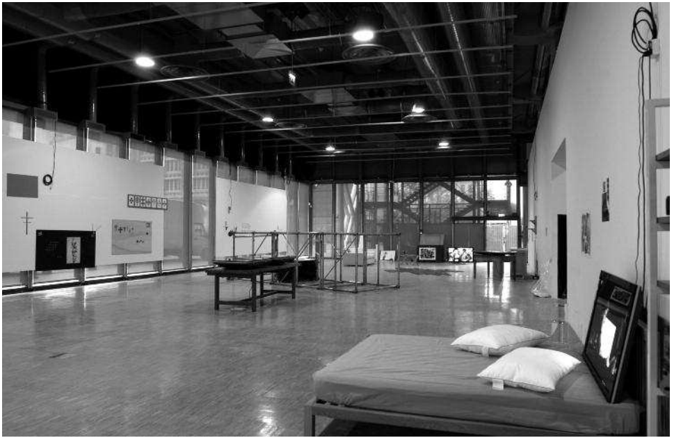
Jean-Luc Godard. Voyage(s) en utopie , Jean-Luc Godard, 1946–2006. Installation view of the “Aujourd’hui” section. Centre Pompidou, Paris, 2006.